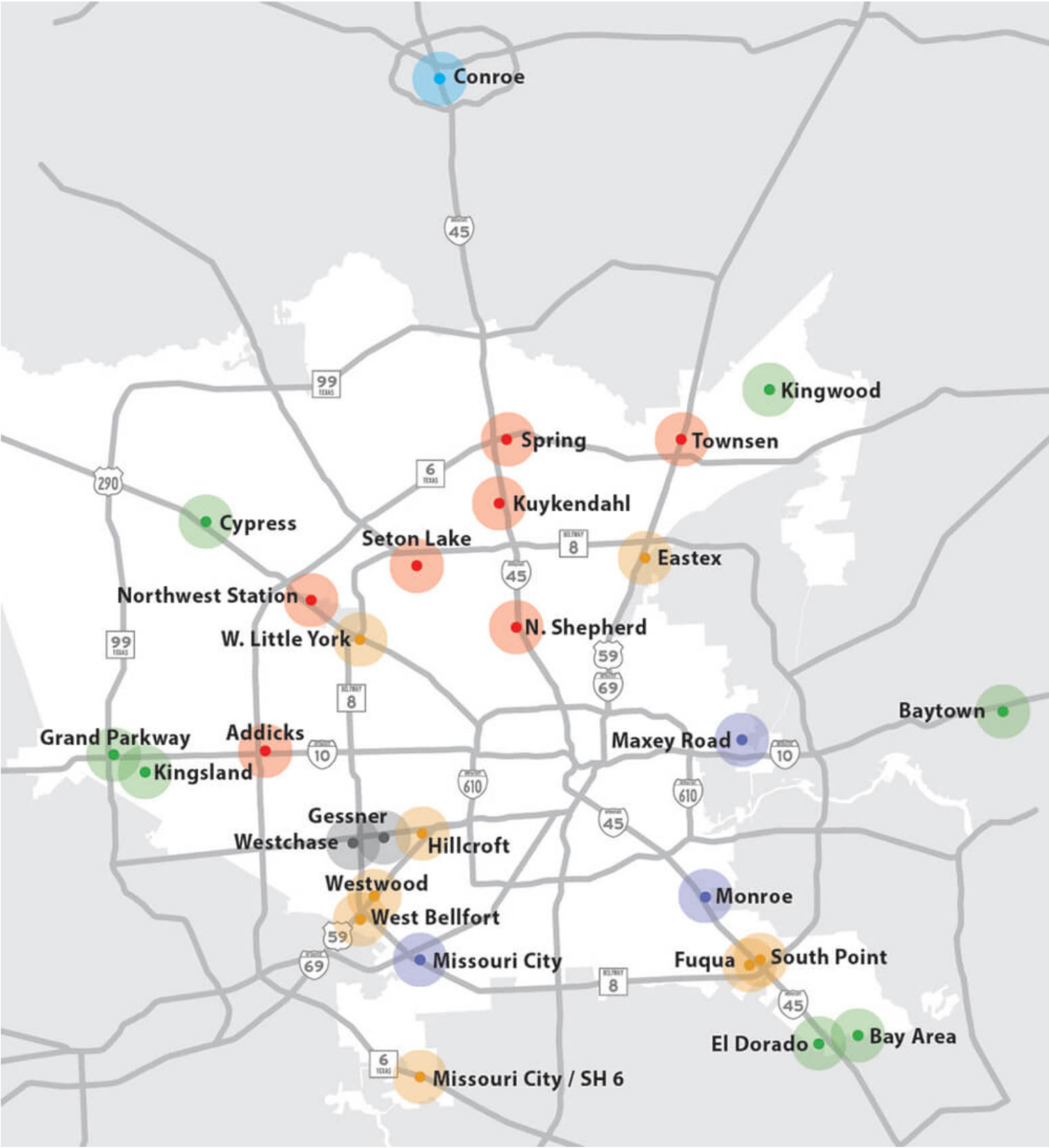
Commuter Network: Park & Ride Service Map